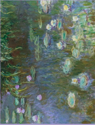
detail Claude Monet, born Giverny, France, 1840, died Giverny, France, 1926, Water Lilies , oil on canvas, 20.07 x 23.4 cm; Purchased with funds from the Libbey Endowment; Gift of Edward D. Drummond Libbey, Toledo Museum of Art, Ohio, United States of America