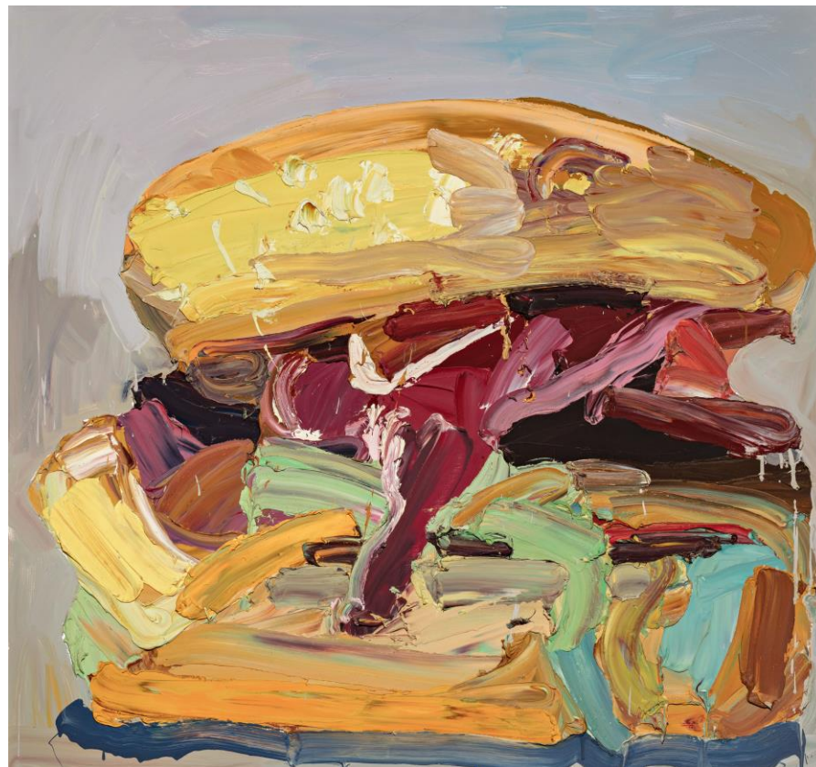
Ben Quilty, Australia, born 1973, The lot , 2006, Bowral, New South Wales, oil on canvas, 150.0 x 160.0 cm; Gift of Ben Quilty through the Art Gallery of South Australia Contemporary Collectors 2016. Donated through the Australian Government's Cultural Gifts Program, Art Gallery of South Australia, Adelaide, Courtesy the artist.