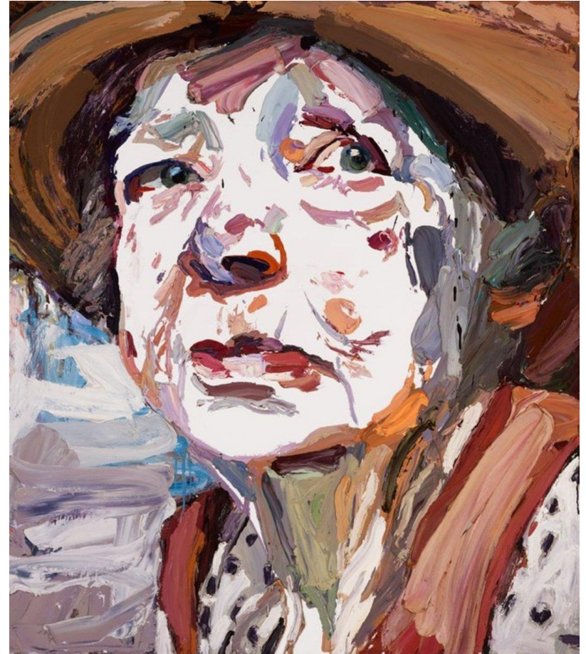
Ben Quilty, Australia, born 1973, Margaret Olley , 2011, Southern Highlands, New South Wales, oil on linen, 170.0 x 150.0 cm; Private collection, Courtesy the artist, photo: Mim Stirling.