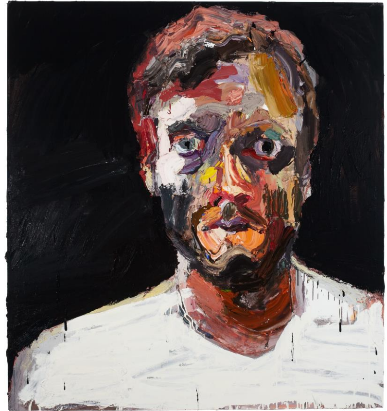
Ben Quilty, Australia, born 1973, Self-portrait after Afghanistan , 2012, Southern Highlands, New South Wales, oil on linen, 130.0 x 120.0 cm; Private collection, Sydney, Courtesy the artist, photo: Mim Stirling.