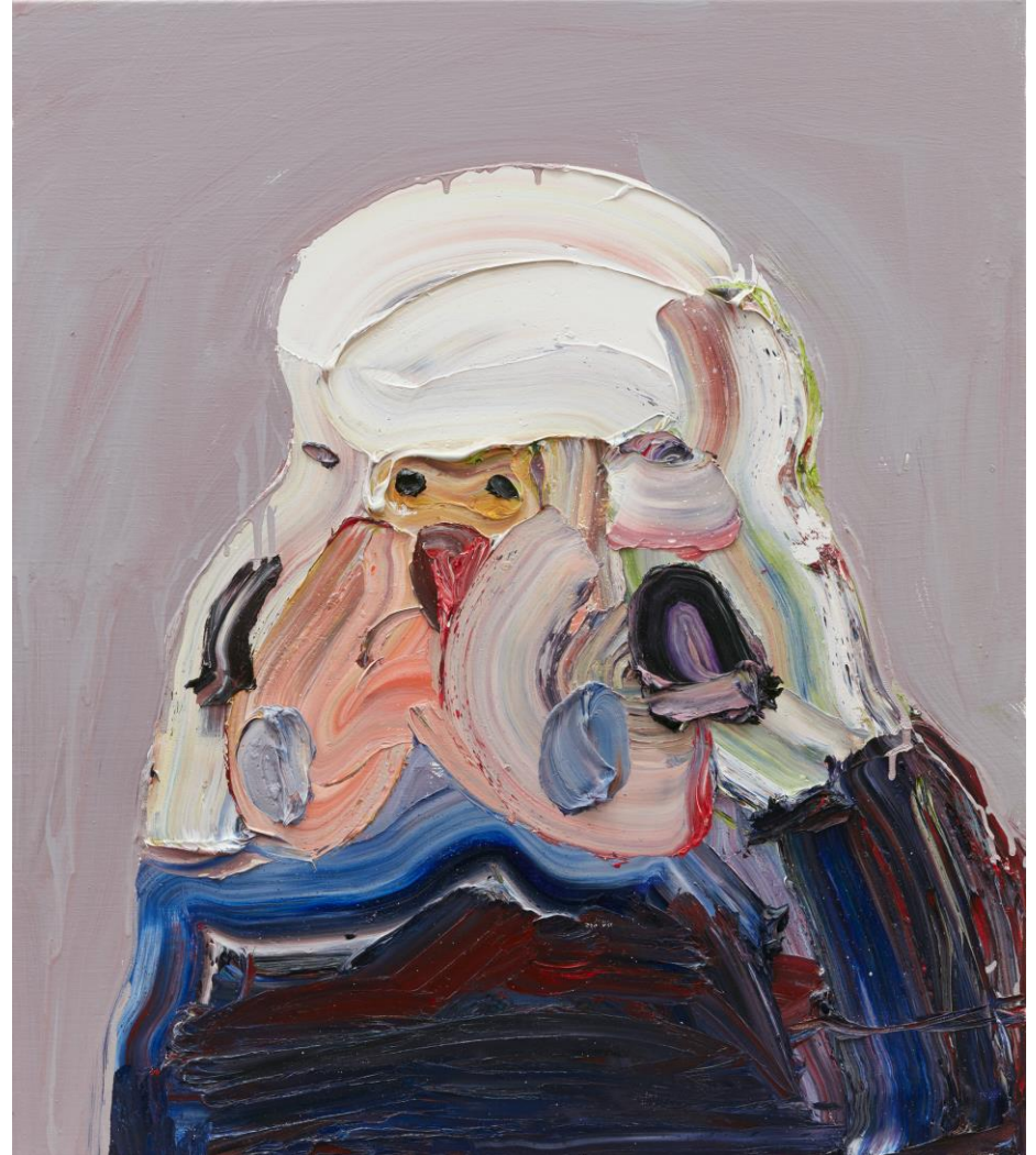
Ben Quilty, Australia, born 1973, New Bird , 2017, Southern Highlands, New South Wales, oil on linen, 80.0 x 70.0 cm; Private collection, Courtesy the artist, photo: Mim Stirling.